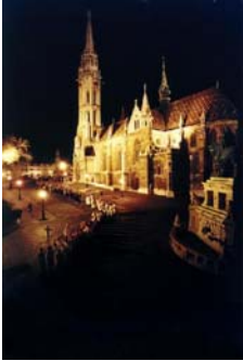
Church of Saint Matthew, Budapest