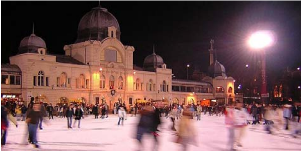
Ice Rink, Budapest