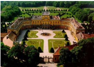
Esterházy Castle, Fertőd