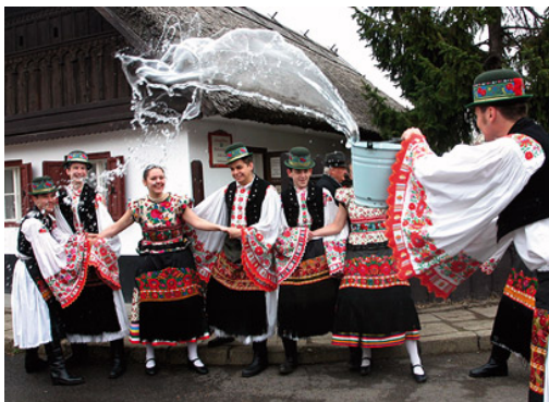
Traditional Hungarian Easter Sprinkling