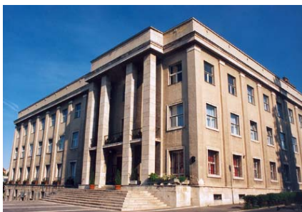
University of Pannonia

Built on seven hills, on the two sides of Séd creek, the “City of Queens” is a prosperous town in the Transdanubian region offering more and more cultural programmes every year. Veszprém is only 15 kms from Hungary’s biggest lake, Lake Balaton, and is bordered by the slopes of Bakony – no wonder it was Queen Gisela’s (St. Stephen’s wife) favourite city.