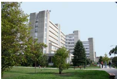
Széchenyi István University

Győr is a mellow and colourful town, the second richest in historic buildings. Situated half way between Budapest and Vienna, on the banks of River Rába, this is a town of festivals where friends of the arts and those who are eager for a high-quality relaxation can find attractive programmes all the year round.