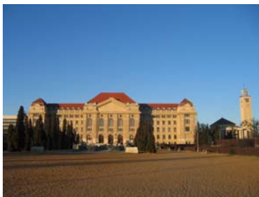
University of Debrecen

Wide streets, spacious squares, the Reformation Cathedral - situated in the North of the Hungarian Great Plain, Debrecen is the second biggest city in Hungary often called the “Calvinist Rome”. It has been the home town of several famous poets, and also the second home for lots of students. The Hortobágy National Park, where you can find the biggest “puszta” with its special flora and fauna, is only a stone’s throw away from the city.