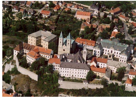
Bird's eye-view of Veszprém