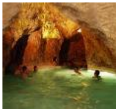
Miskolc Tapolca Thermal Bath and Spa