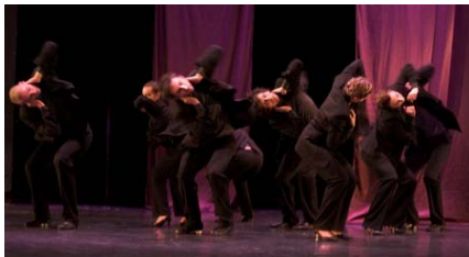
Contemporary Ballet Theatre