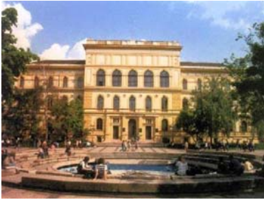
University of Szeged

Fascinating streets, beautiful squares, and the shore of the Tisza are perfect scenery for the unforgettable schooldays in Szeged. The city of sun is rich in cultural programmes, festivals, let alone its lively weekdays with the cosy pubs and clubs designed especially for students.