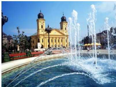
Downtown - Debrecen