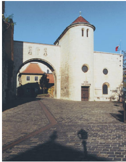
Entrance to the Castle