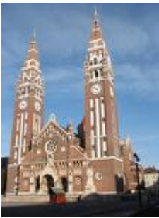
Votive Church, Szeged