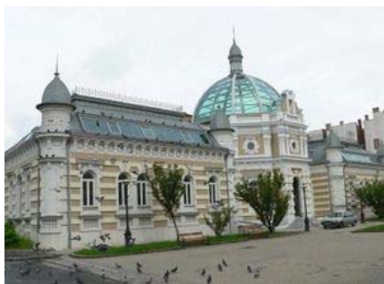
Miskolc Erzsébet spa