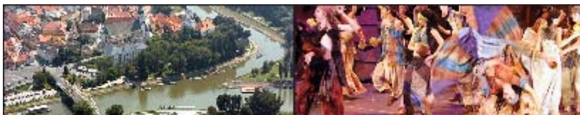
Bird's eye view of Győr