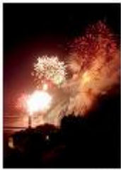
20th August - Saint Stephen Day; State Foundation Day