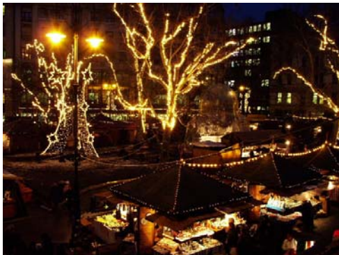
Christmas Fair in Budapest