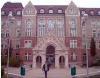
University of Pécs

Narrow streets, Mediterranean atmosphere with some monuments of the Turkish occupation surrounded with the slopes of Mecsek. Pécs is a city offering several higher education programmes together with a vivid cultural life. What is more, you have to travel just a little and you find yourself on one of the most significant wine producing areas.