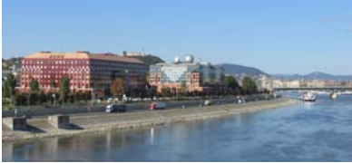
Eötvös Loránd University

Budapest is the capital city of Hungary and the country's major political, cultural, commercial, industrial and transportation centre. The fascinating, busy city is also the home of many state, denominational and foundation universities. The Eötvös Loránd University or ELTE, founded in 1635, is one of the oldest and the largest universities in Hungary