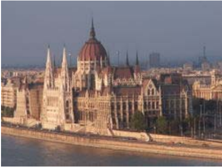
The Hungarian Parliament, Budapest